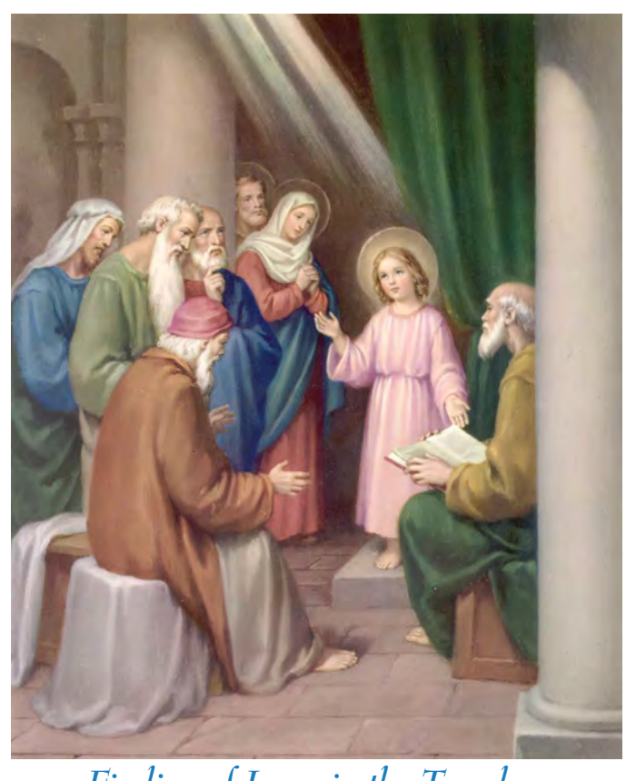
Finding of Jesus in the Temple