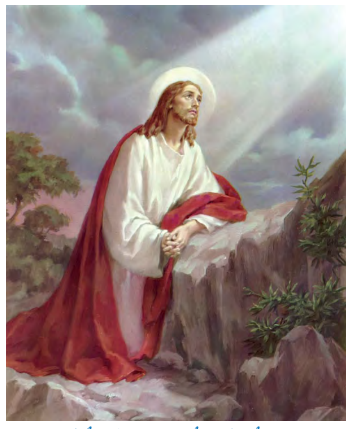
The Agony in the Garden