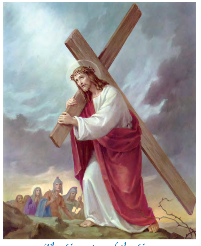
The Carrying of the Cross