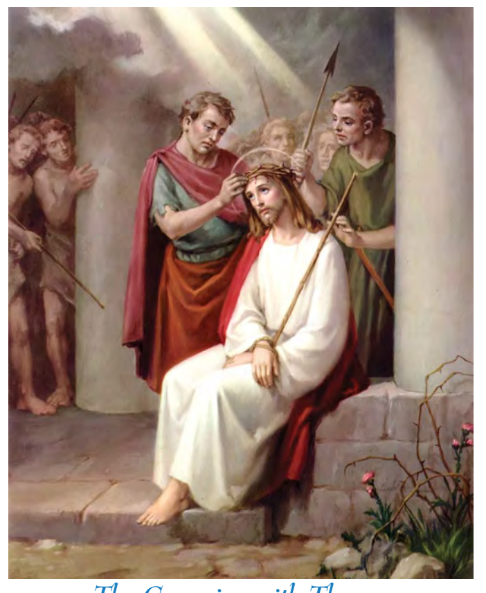
The Crowning with Thorns