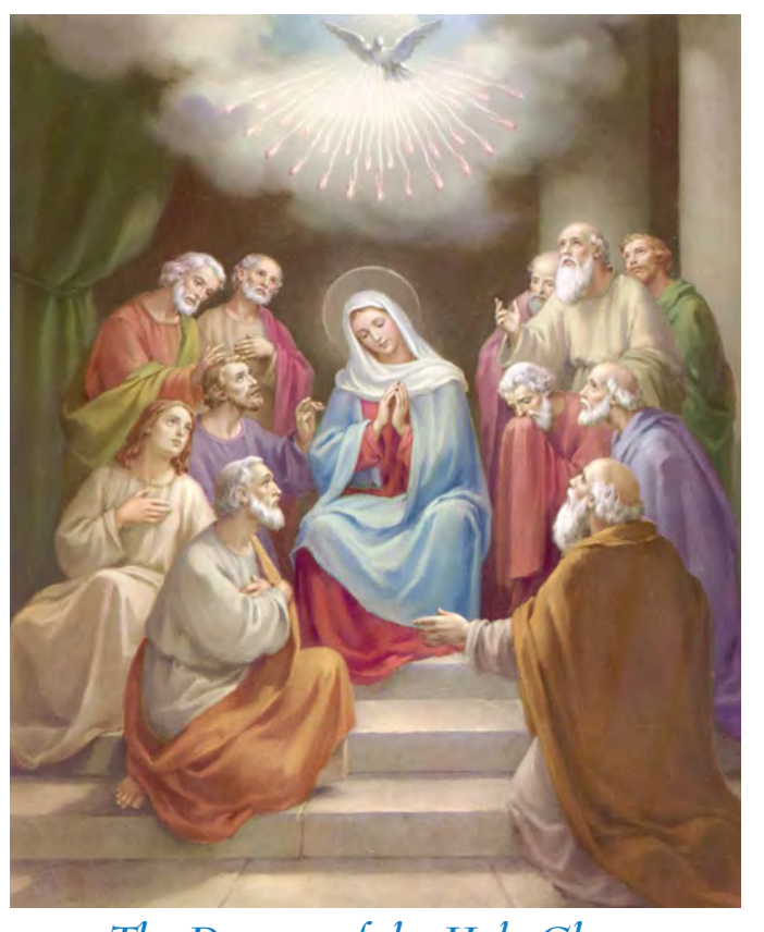
The Descent of the Holy Ghost