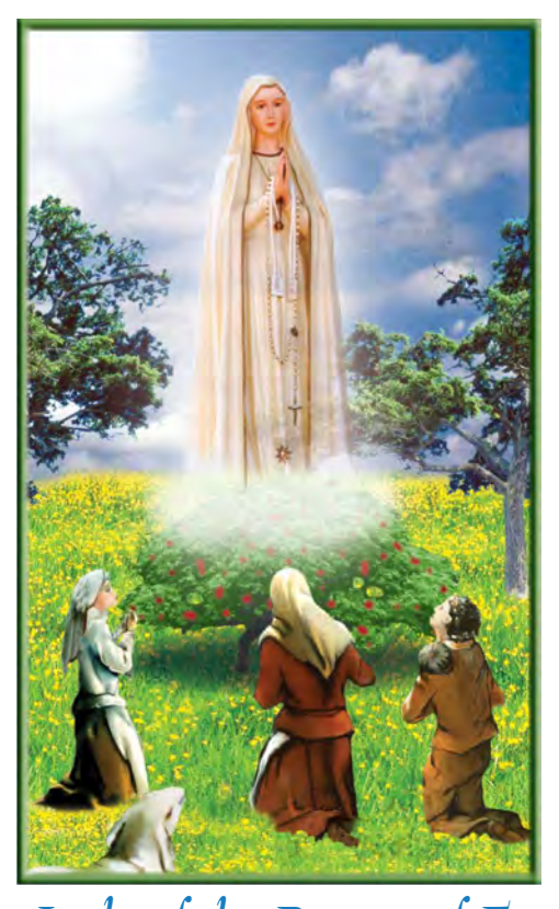
Our Lady of the Rosary of Fatima