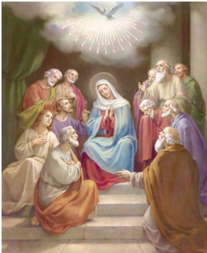
The Descent of the Holy Ghost