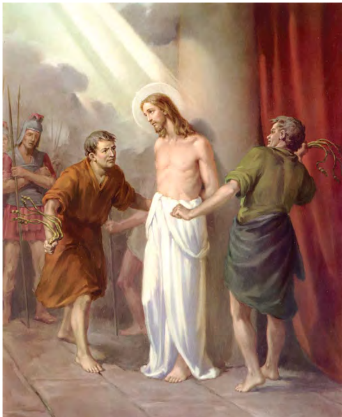
The Scouring at the Pillar