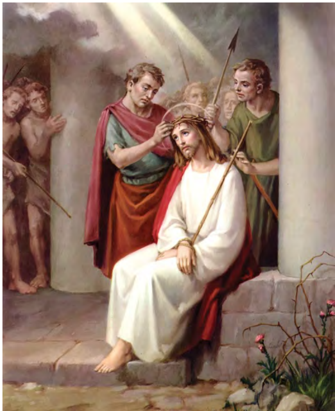
The Crowning with Thorns