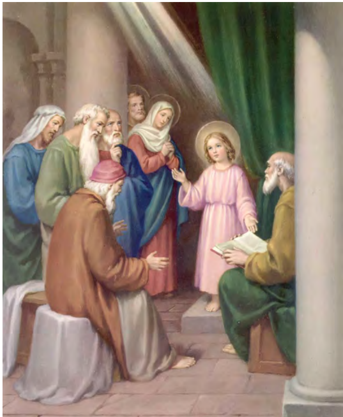
Finding of Jesus in the Temple