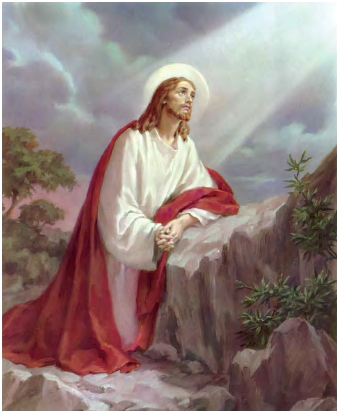
The Agony in the Garden