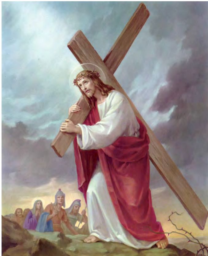
The Carrying of the Cross