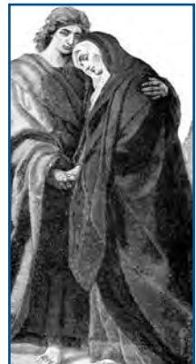
The Mother of Sorrows with St. John

In order to grasp the meaning of this last sorrow more fully, let us return to Calvary and picture our