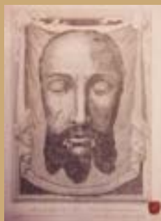
The Veil of Veronica