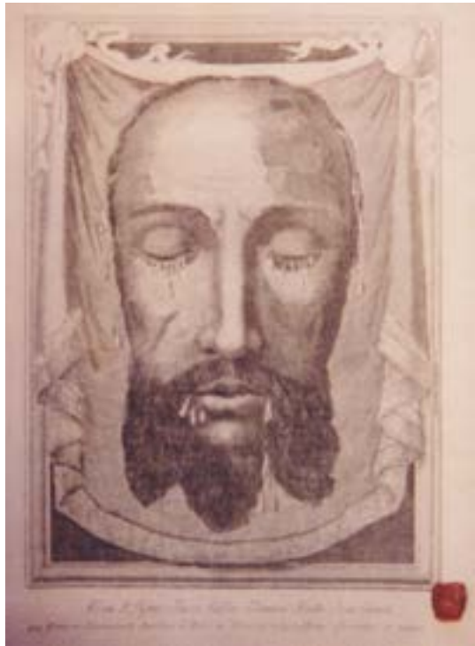
The Veil of Veronica