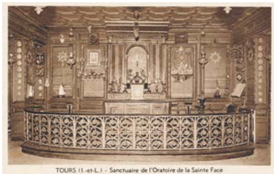
TOURS (1.-et-L.) - Sanctuaire de l'Oratoire de la Sainte Face

The Holy Man of Tours, Leon Dupont, turned his parlor into an Oratory in which he had hung an image of the Holy Face (above). Here, through devotion to the Holy Face, M. Dupont worked so many miracles, especially miraculous healings, that Blessed Pius IX called Dupont perhaps the “greatest miracle-worker in Church history.”