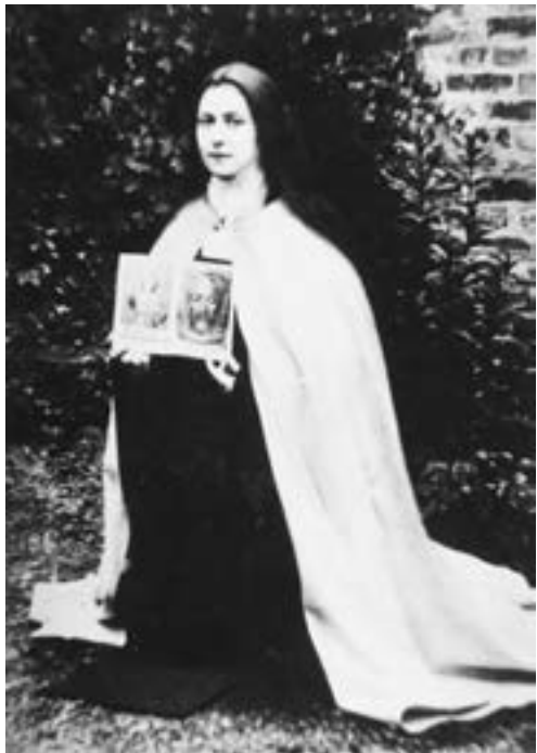
St. Thérèse and her family were some of the first to become members of the Confraternity of the Holy Face.

When we meditate on the Passion of Our Lord, we receive special graces that we do not receive when we meditate on His Sermon on