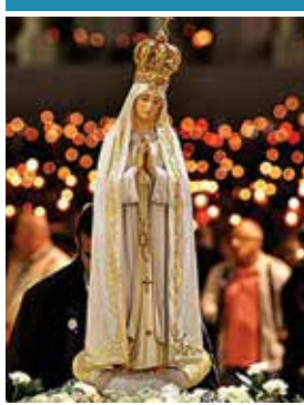
Rosary & Procession