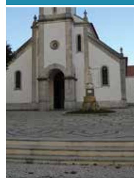
Fatima Parish Church