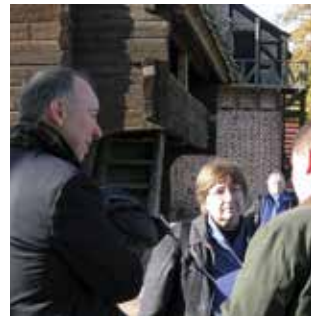
The Latin Mass was celebrated on Sunday in an old museum church which we rented after being refused to celebrate Mass at one of the two Catholic churches left in Sweden.